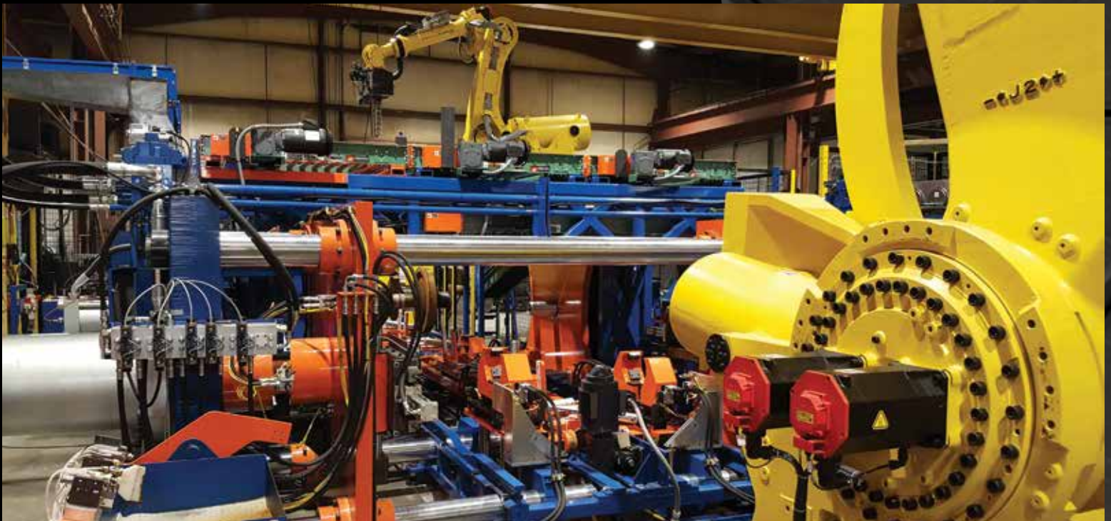
Rail Car Wheel & Axle Assembly Cell